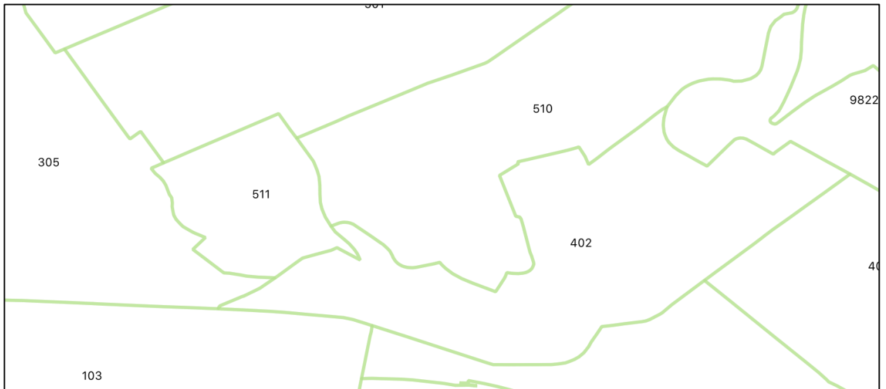
Figure 2: Tract 402 Boudary for the 2010 Census