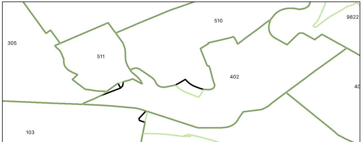
Figure 3: Tract 402 Shared Area Between the 2000 and 2010 Censuses

In Figure 3 above, the dark green line indicates boundary lines that did not change between the two Censuses. The black line indicates boundaries unique to 2000, and the light green line indicates boundaries unique to 2010.